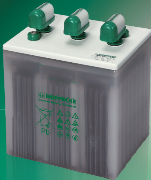
Similar to the illustration, AquaGen® optional.